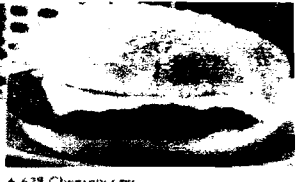
▲ 628 Cheeseburger